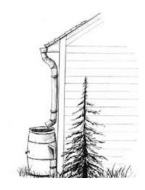
Artwork courtesy of: Activities to Encourage Restoration, ww.watershedactivies.com